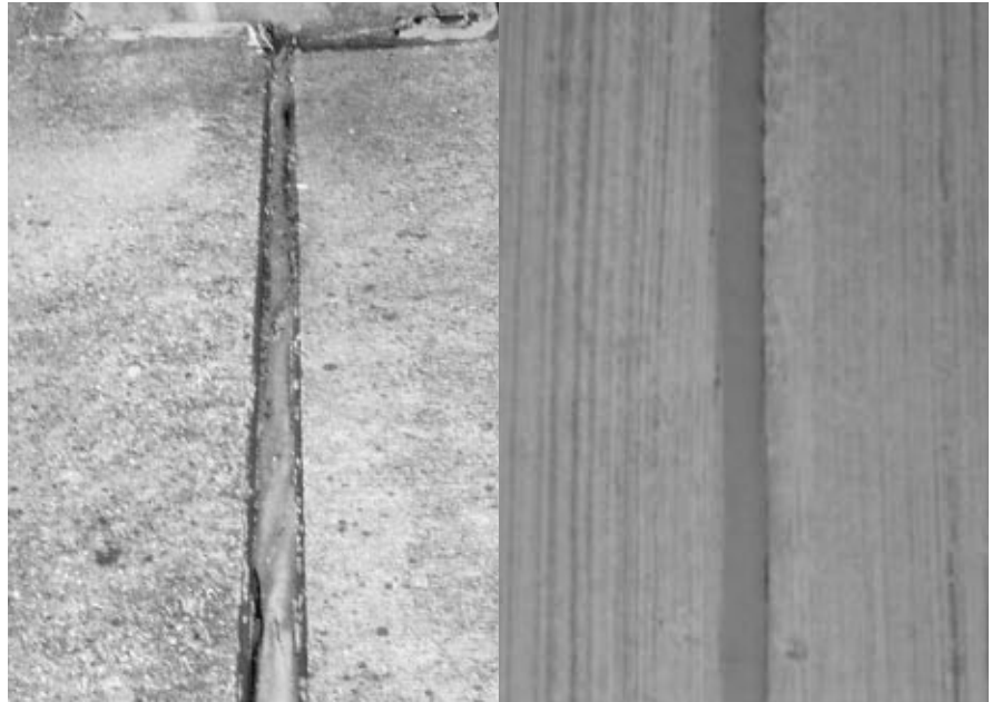
Housekeeping should include frequent cleaning of joints. Clean joints will increase service life.

the parking facility has. Lack of attention is an invitation to loiter in the parking facility and may reduce safety of use. Sweeping should remove debris and sand from drains, expansion joints, and control joints. Cleaning should include removal of litter from beam ledges and member joints.