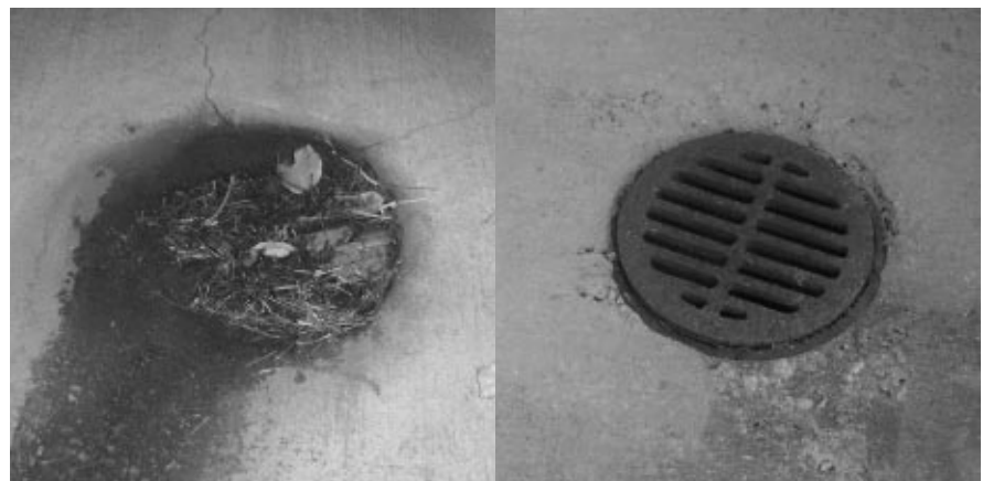
Drains not properly cleaned will cease to function and produce ponding, deterioration and costly repairs.

Studies have shown that fine cracks (0.007 in. or less) are typically regarded as non-detrimental to the serviceability of the deck and have little influence on the corrosion process. This is due to the dense matrix of the concrete and the shal-