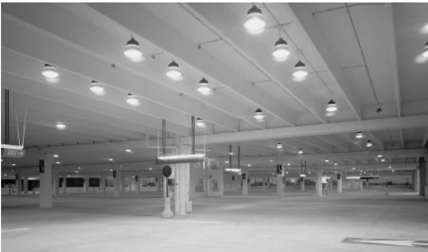
Well maintained parking structures provides a user friendly atmosphere and promotes repeat business.

In addition to increasing service life and reducing long term structural repairs, a comprehensive maintenance program will produce a cleaner, safer and more user friendly atmosphere which promotes repeat business and discourages littering and loitering. A well maintained parking structure also reflects a positive image on the owner/operator, adjacent businesses or even an entire city for structures located at airports or major downtown areas. Thus, it is essential for a maintenance program to be a major phase in the operation of all parking structures. A routine maintenance program should be set up immediately upon turnover of the parking structure.