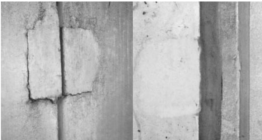
Recessed connections may need periodic maintenance.

It is common practice for welded connections between members to be recessed and covered with a cement grout to conceal and protect the connection plates. If the thermal properties of the protection layer vary from those of the base concrete, cracks may form over time at the edges of the recess.